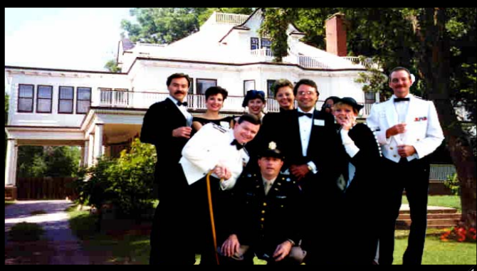
The Usual Suspects

We do Murder Mysteries every Friday and Saturday Night for anyone wishing to participate. You do not need a group to attend a murder on the weekends. The price for a Murder Mystery is $52. per person on Fri. and Sat. not including lodging. The Mysteries include a 7 course dinner and beverages (alcoholic beverages not included). If you wish to spend the night, the average package with lodging is $215. per couple . The average cost varies depending on the room size and amenities you choose. Included in the package when you spend the night is the 7 course dinner, the murder mystery party, night's lodging and a great breakfast in the morning (if you live). You do not have to be a couple to attend. You might be two girl friends or guy